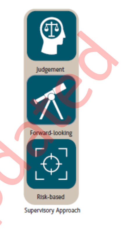
Figure 1: Key principles of our supervisory approach

To advance our objectives, our supervisory approach follows three key principles – it is: i) judgement-based; ii) forward-looking; and iii) focused on key risks. Across all of these principles, we are committed to applying the principle of proportionality in our supervision of firms.