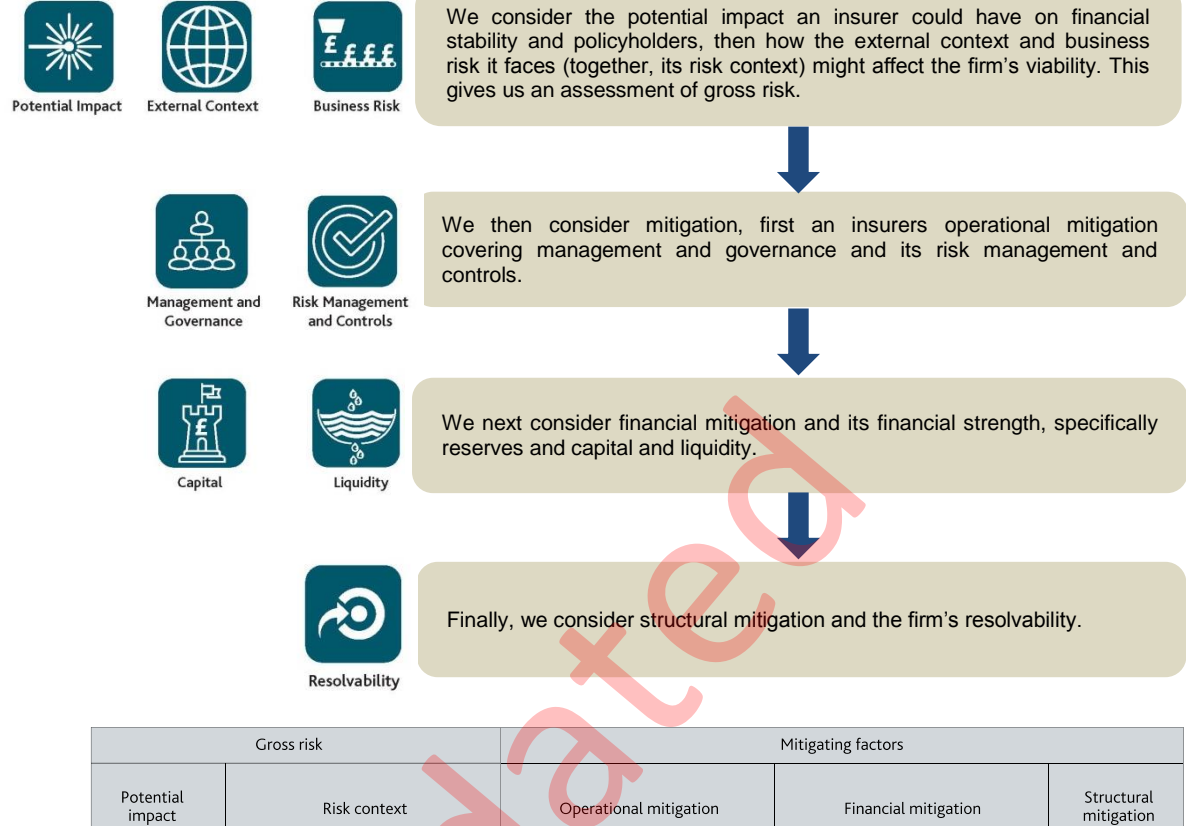
Figure 2: Our risk assessment framework