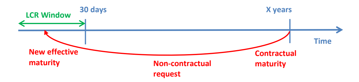
Chart 1: Effect of a counterparty non-contractual request on maturity

4.3 Franchise viability risk is an open-ended category. It includes risks from prime brokerage, matched books, debt buyback, early termination of non-margined derivatives and settlement failure risk. Chart 1 depicts a counterparty non-contractual request and the impact this may have on maturity.